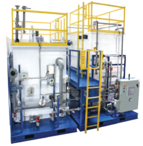
Concentrated pH Adjustment Systems Lab & Industrial systems for neutralization of concentrated waste