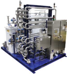
ProDELTA™ Thermal BioKill System Biological deactivation unit that uses heat to destroy biological waste