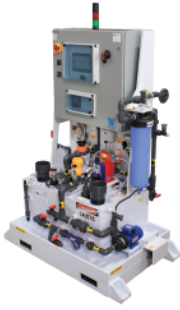
LabDELTA™ pH Adjustment Systems Laboratory waste neutralization system for small flows or batches