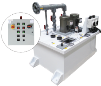
Vertical PLS For transferring water, chemicals and wastewater