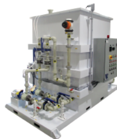
High Capacity PLS For transferring high volumes of chemicals & wastewater