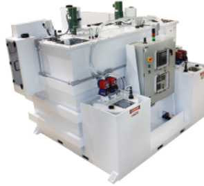
ProDELTA™ Chemical BioKill System Biological deactivation unit that uses chemicals to destroy biological waste