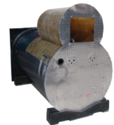
Fiberglass PLS For below grade installations with submersible pumps