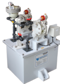
Air Operated PLS Safely & efficiently transfers wastewater & slurries