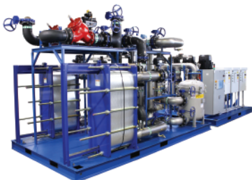
Process Chilled Water System that includes pumps, heat exchangers & controls