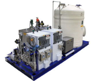
ProDELTA™ Thermal BioKill pH Adjustment System Automated biological deactivation and acid waste neutralization on one skid