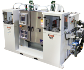
ProDELTA™ pH Adjustment Systems Industrial waste neutralization systems for large flows or batches